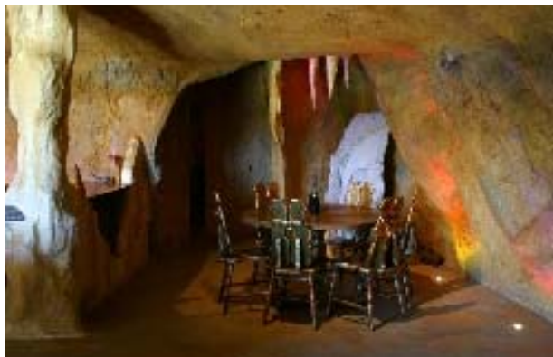
A view inside the Mirra Mirra 'cave'.

The Orient Cave is now fully re-lit, and all reports are that it is great (as you'd expect!). Evidentially, the original plan to do Ribbon Cave at the same time didn't happen (unfortunately), although the Ribbon lighting isn't that much out-of-date. The next lighting challenge is to finish both River and Imperial Caves. Of Jenolan's ten show caves that will, effectively, leave only Jubilee Cave not up to scratch – a great effort considering the sorry state of most Jenolan show caves only a few years ago.