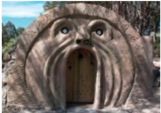
The Magog or cave entrance – Mirra Mirra

See: < http://miramira.com.au/the_cave_house >